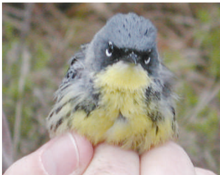
Some migrants are at risk in their winter habitat.

Many songbirds that make long annual migrations between northern latitudes and the tropics have been declining for decades. The reasons have confounded researchers, who until recently have not been able to connect breeding populations in the north with specific wintering populations in the south. "The