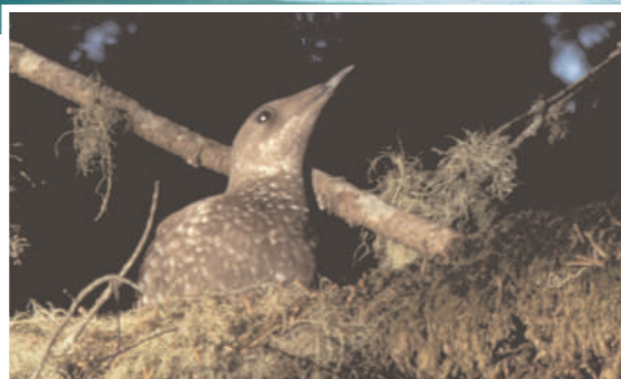
Species across the globe, from penguins to marbled murrelets, could benefit from isotope tracking.

Even the hidden physiologies of animals can be revealed by isotope analysis. The heavier isotope of nitrogen occurs in much higher concentrations in marine than in terrestrial or